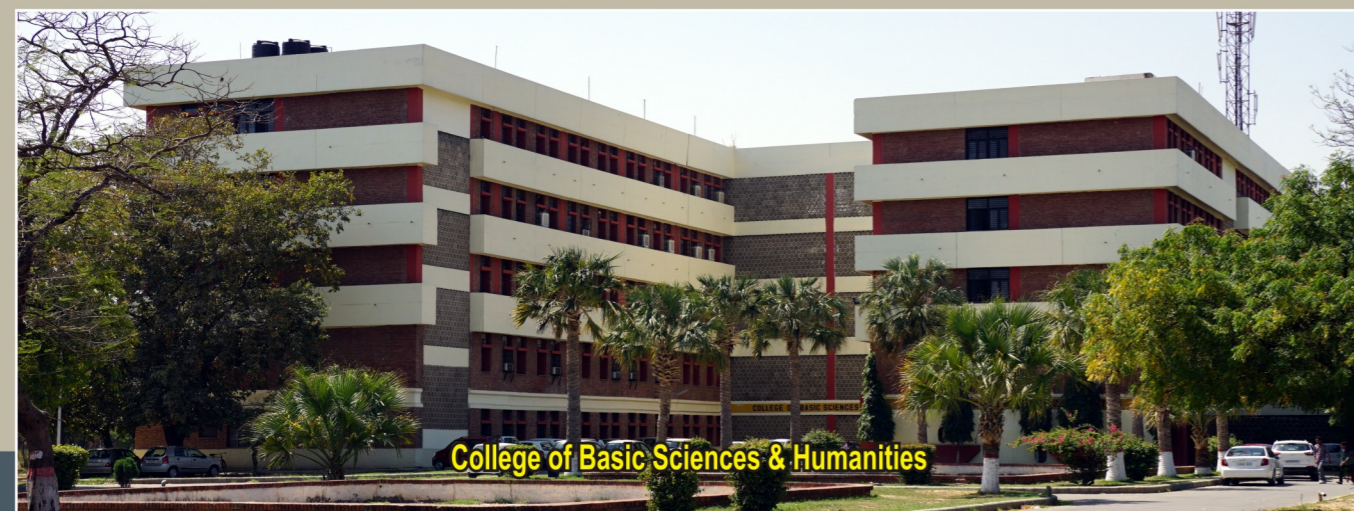
College of Basic Sciences & Humanities