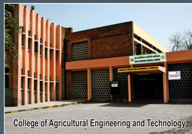
College of Agricultural Engineering and Technology