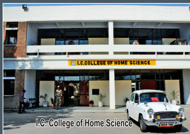
I.C. College of Home Science