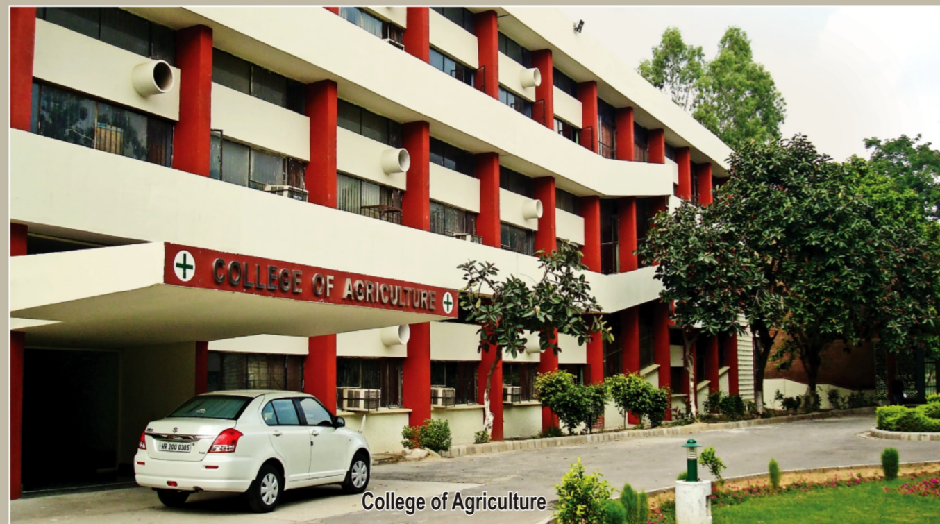
College of Agriculture