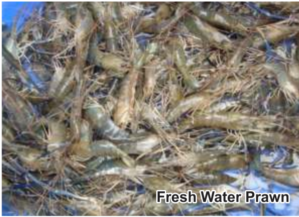
Fresh Water Prawn