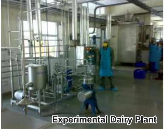
Experimental Dairy Plant