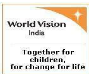
District Disability Rehabilitation Centre