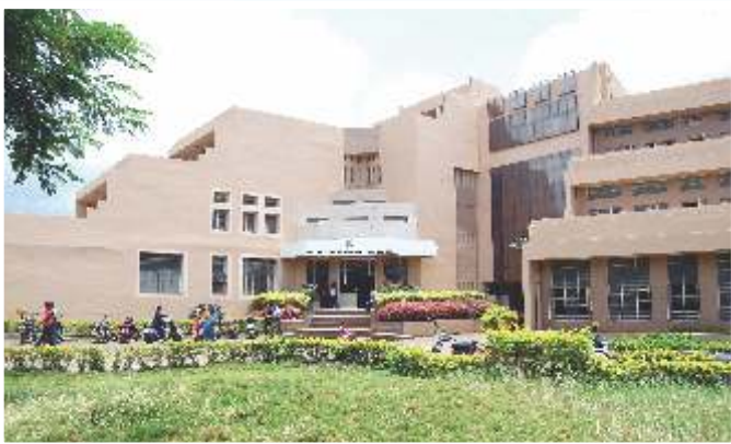
Institute of Management, Kolhapur