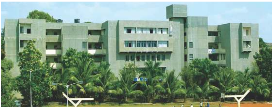
Institute of Management and Entrepreneurship Development, Pune