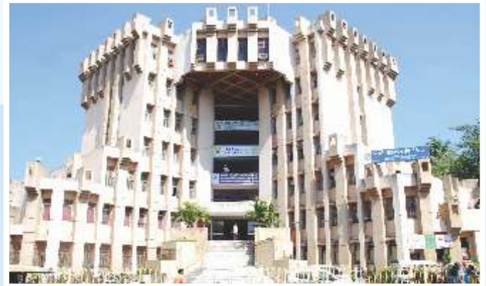
Institute of Management and Rural Development Administration, Sangli