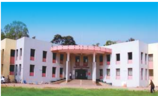
Yashwantrao Mohite Institute of Management, Karad