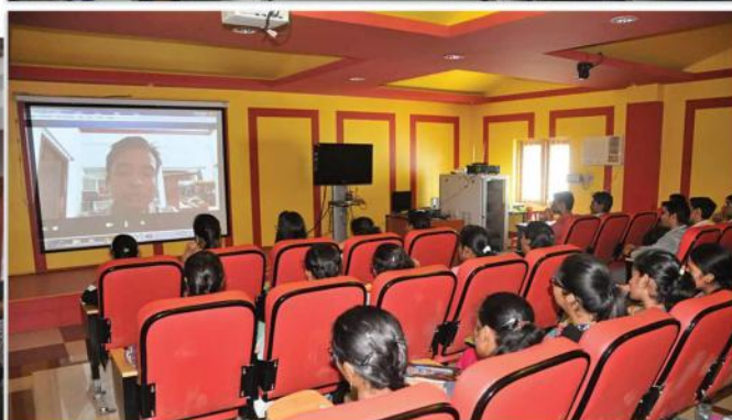
V SAT Lab