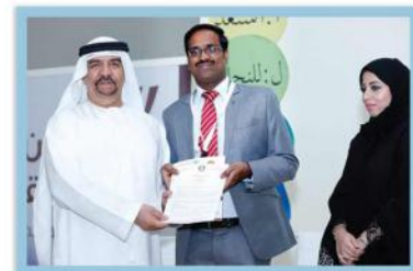
Veltech University signed broad-based MOUs with Government of Fujairah, UAE