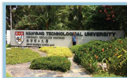
Funded Research internship at Nanyang Technological University, Singapore