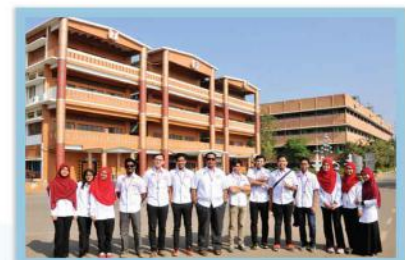
Students from University Putra Malaysia on a Semester Exchange Programme at Veltech University