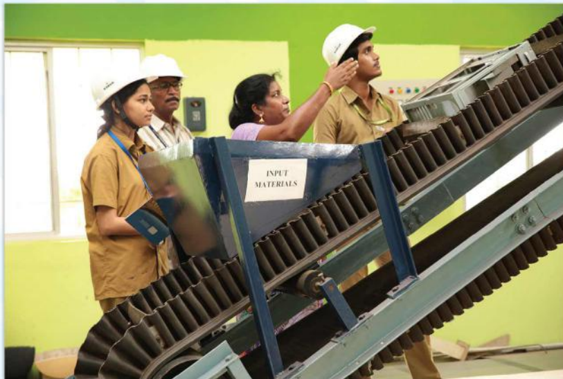
STUDENTS WORKING ON E-WASTE MANAGEMENT