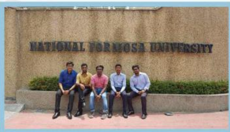
Veltech students at National Formosa University, Taiwan for Internship