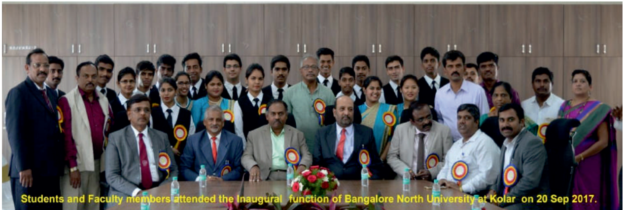
Students and Faculty members attended the Inaugural function of Bangalore North University at Kolar on 20 Sep 2017.