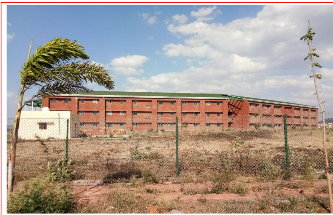
GUEST HOUSE, IGNTU