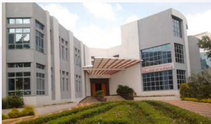
College of Nursing, Sangli