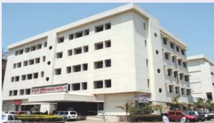
Bharati Hospital, Pune