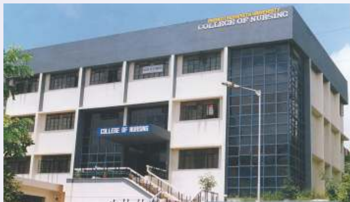
College of Nursing, Pune