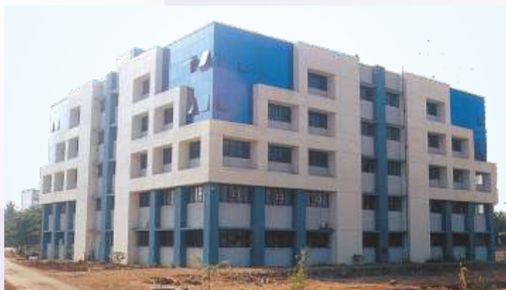
College of Nursing, Navi Mumbai