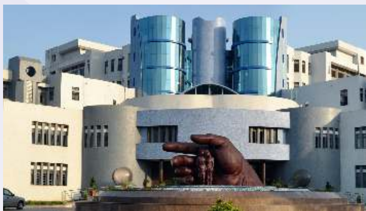
Bharati Hospital, Sangli