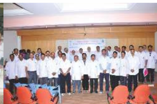
Celebration of Pharmacists Day