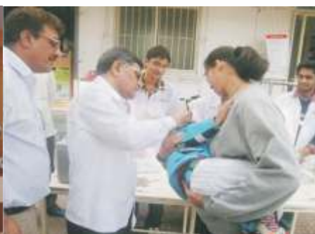
Participation in Polio vaccination campaign