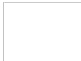
Left Thumb Impression of the Parent/Guardian