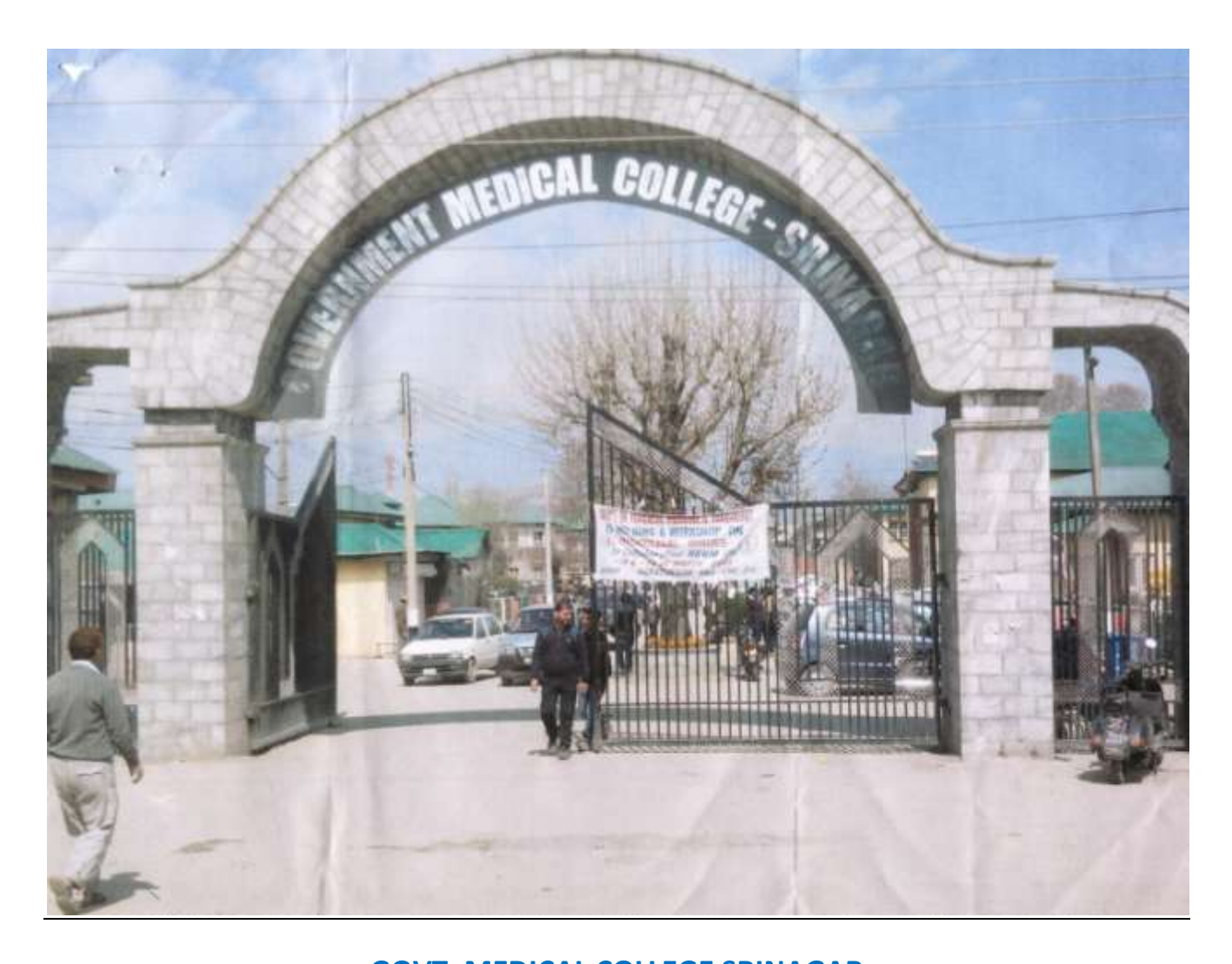
GOVT. MEDICAL COLLEGE SRINAGAR