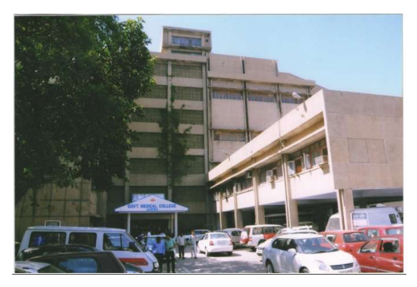
GOVT. MEDICAL COLLEGE, JAMMU