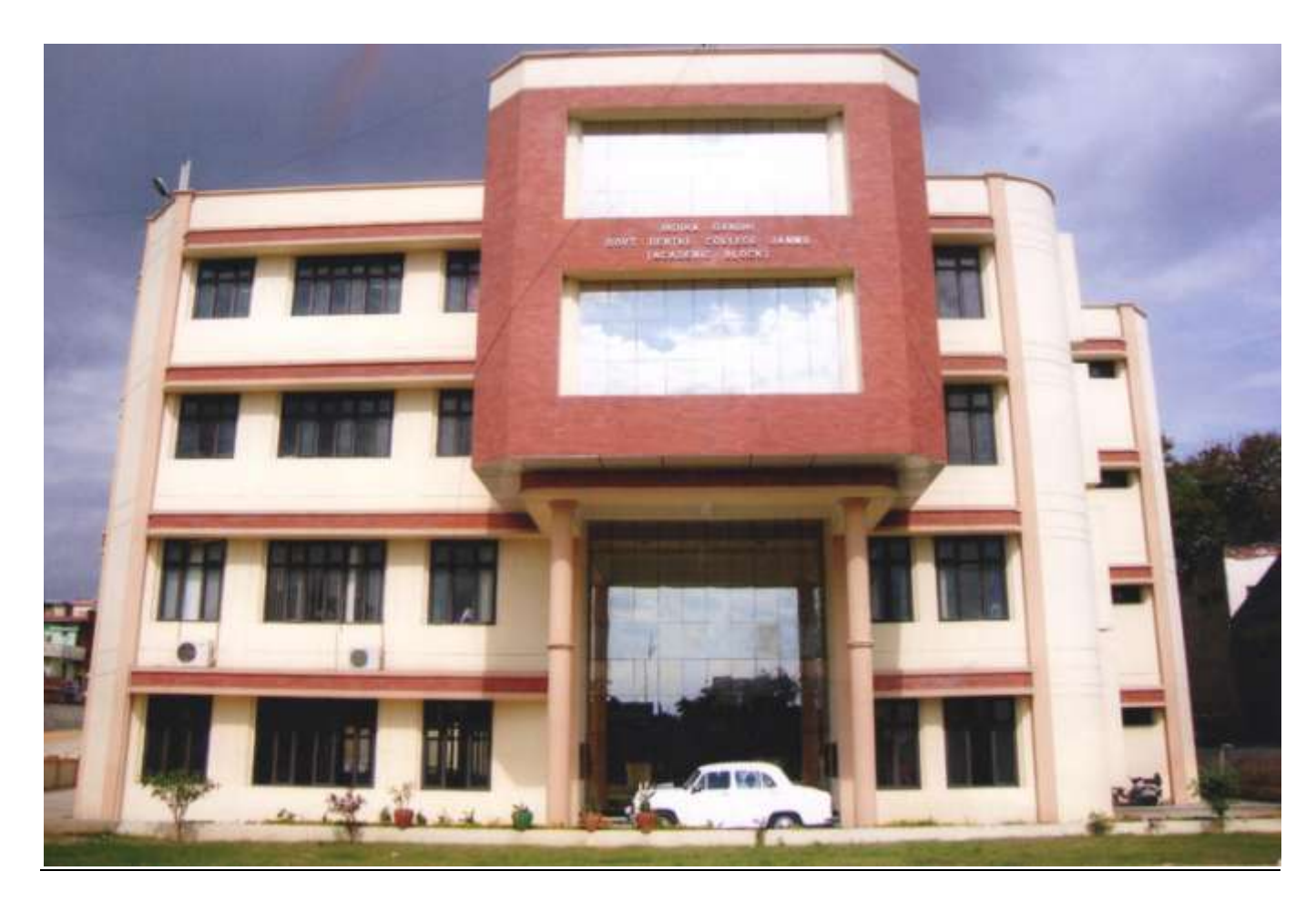
GOVT. DENTAL COLLEGE, JAMMU

Phone: 0191-2544670, 2565630 Fax: 0191-2565588