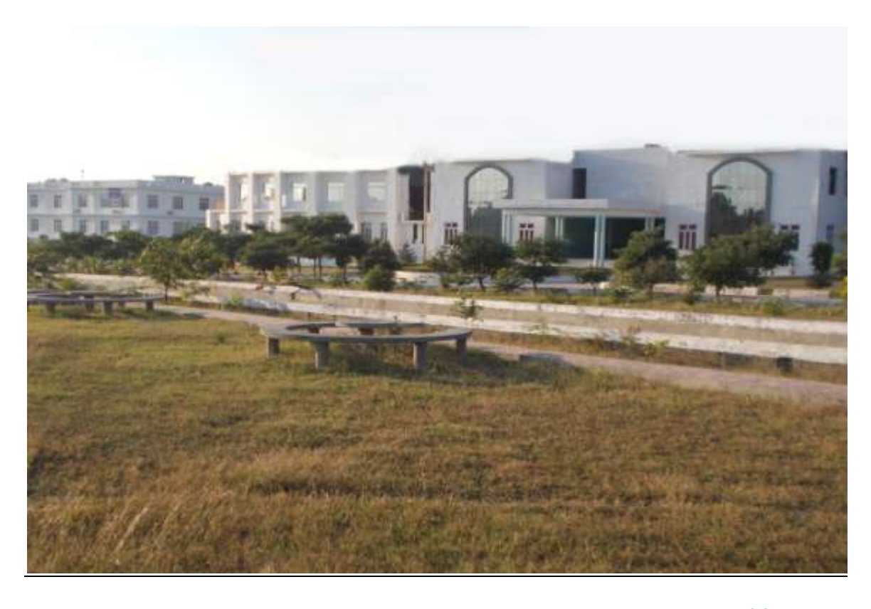
Yogananda College of Engineering and Technology, Jammu**

Phone: 0191-2605601, 2605602, 2605603 Fax: 0191-2605604