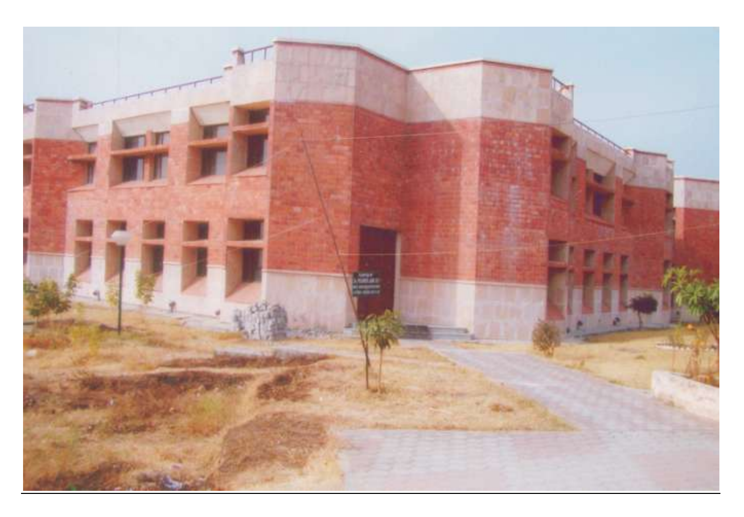
GOVT COLLEGE OF ENGINEERING & TECHNOLOGY, JAMMU

Phone: 0191-2546244, 2544863 Fax: 0191-2560359