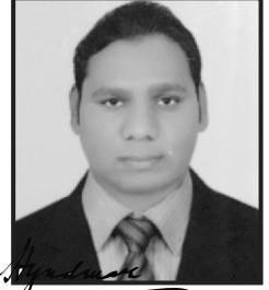
Signature of Candidate

2. Birth-date (dd/mm/yyyy) 0 9 0 2 1 9 8 2