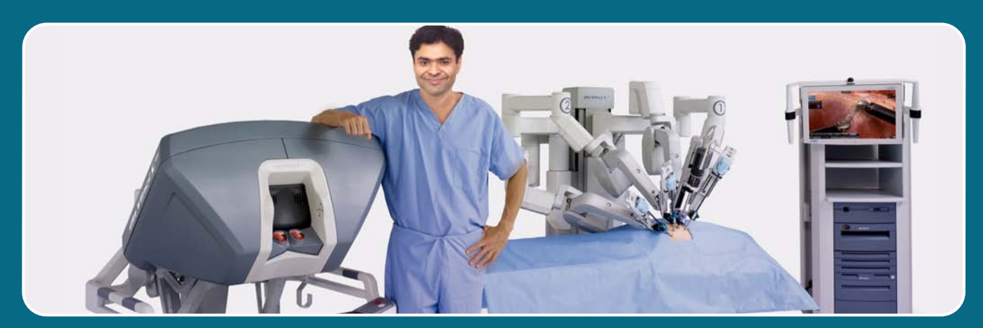
DA Vinci SI Robotics (1st in Madhya Pradesh)