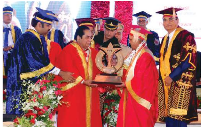
Felicitation of Chief Guest Shri. Pranab Mukherjee President of India