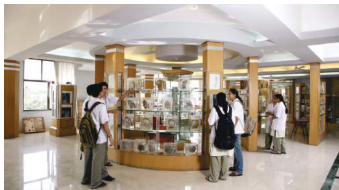
■ Anatomy Museum

A good hospital gives any medical college a fine learning reputation. The hospital provides ample and varied clinical material to the students, enabling them to be conversant with multitudes of ailments, infirmities and diseases and treatments thereon. Dr. D. Y. Patil Medical College has a 1290 bed hospital with all modern amenities and equipments from the learning point of view. It caters to all the specialities and is manned by highly qualified, successful and experienced faculty members. The hospital is well equipped with modern amenities required for treatment including C.T. Scan, Colour Doppler, MRI, Sonography, Endoscopy, Colposcopy, Lithotripsy Machine, 100 watt Holmium Laser Unit with C-Arm and Image Intensifier, latest models of anaesthetic machines, Bactec Systems, Real Time PCR. The hospital has excellent backup of the supporting departments and ultra modern laboratories.