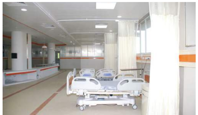
■ Intensive Care Units (ICUs)