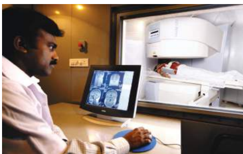
■ MRI - I