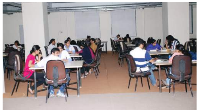
■ Library - Reading Hall