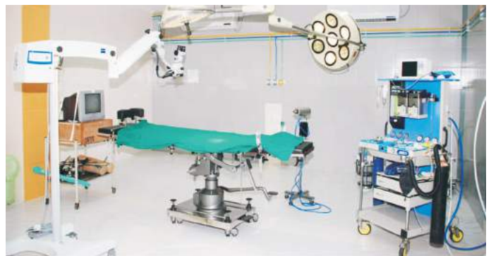
■ Operation Theatre