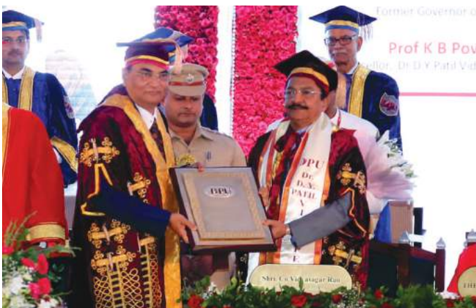
Felicitation of Shri. CH Vidyasagar Rao Governor of Maharashtra