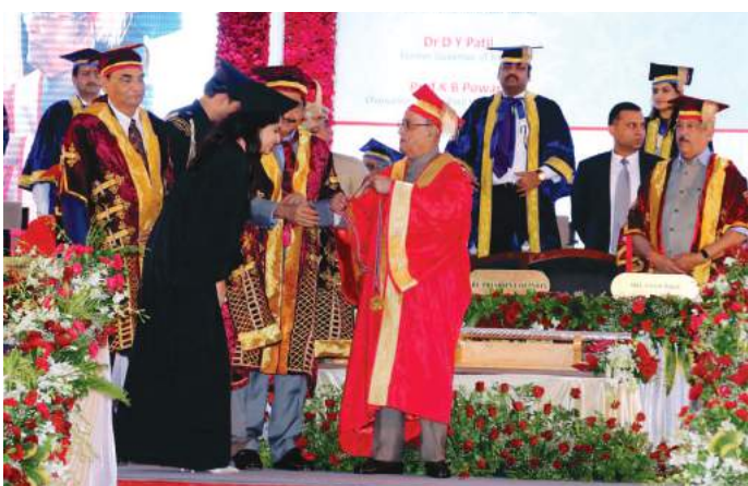
Gold Medal Awarded by Hon'ble Shri. Pranab Mukherjee President of India