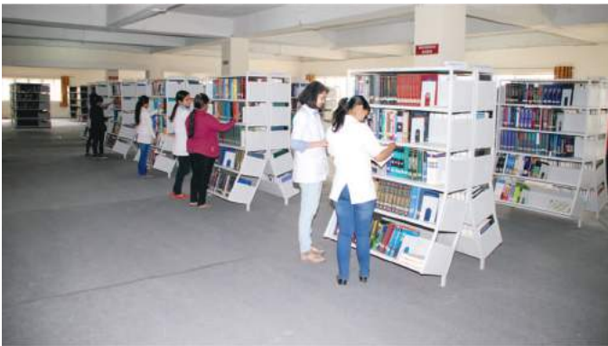
■ Library - Reference Section

The central library has been provided with Wi-Fi internet facility and students and the faculty have open access to this facility. As the College and hostels are 'Wi-Fi' enabled, the students can access information from any point any where.