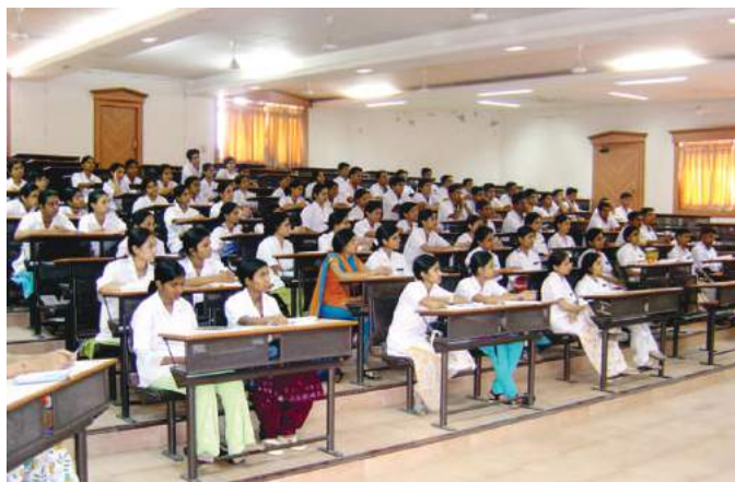
■ Lecture Hall