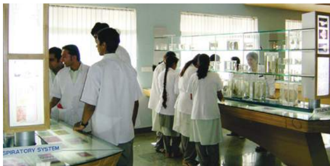
■ Pathology Museum