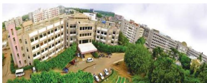
■ Vidyapeeth Campus

In 2003, the college was permitted to conduct postgraduate courses in a some subjects. In June 2005, the college was allowed an intake of 81 students in post graduate degree and diploma courses. Presently there are 250 intake for MBBS and 126 PG-students in the following 20 subjects : General Surgery, Obstetrics & Gynaecology, Orthopaedics, Ophthalmology, Otorhinolaryngology (ENT), General Medicine, Paediatrics, Anaesthesiology, Psychiatry, Radiodiagnosis, Respiratory Medicine, Dermatology, Venerology and Leprosy, Pathology,