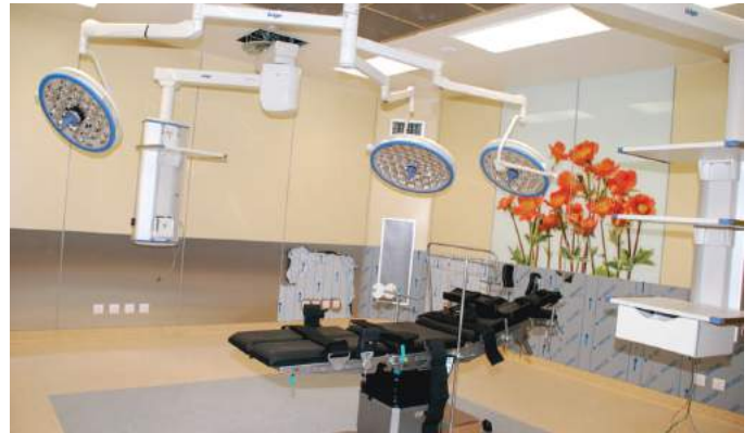
■ Operation Theaters