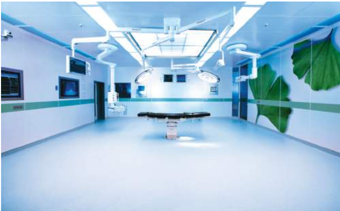
■ Operation Theaters