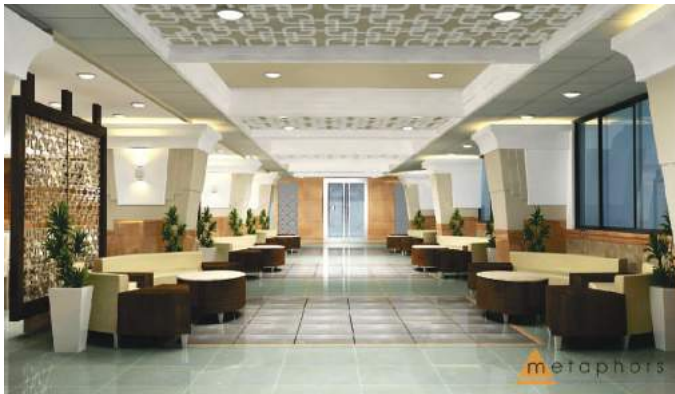
■ Entrance Lobby

Cancer diagnostic & treatments including radiotherapy, ultra fast cardiac C. T. scan, In-Vitro Fertilization and embryo transplant (test tube baby), trauma centre, eye bank, stem cell bank, bone marrow bank, blood bank with component separation facility, Cardiac, surgical, medical, neonatal & paediatric intensive care units, etc. The hospital is proposed to have a helipad with facilities for air ambulance in case of emergencies