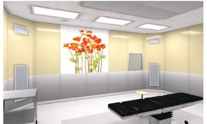
■ Cath Lab