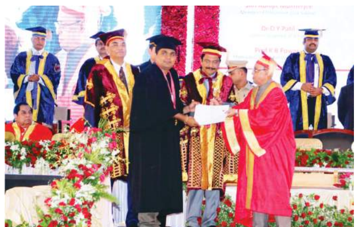
Gold Medal Awarded by Hon'ble Shri. Pranab Mukherjee President of India