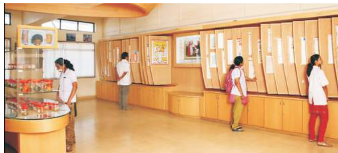
■ Community Medicine Museum