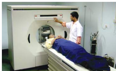
■ CT - SCAN