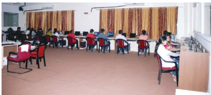
■ Internet Section & e-Library