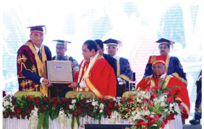
Felicitation of Dr. D. Y. Patil Former Governor of Bihar