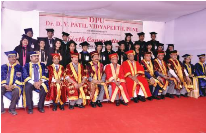
Gold Medal Awardees with Chief Guest