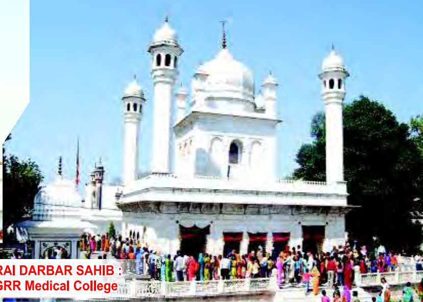
SHRI GURU RAM RAI DARBAR SAHIB : Parent Body of SGRR Medical College