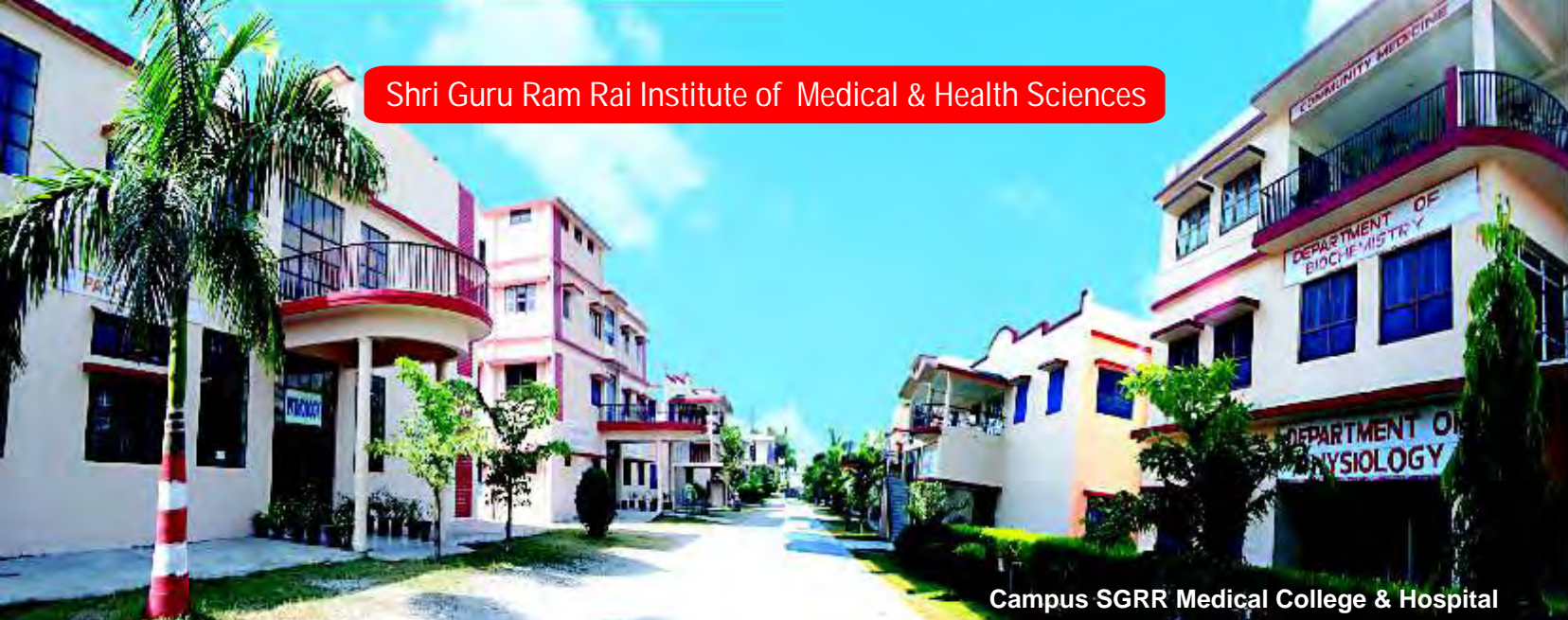
Campus SGRR Medical College & Hospital