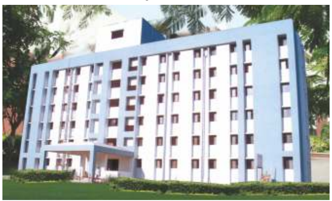
Total Area - 33000 Sq.ft. Total number of Rooms -76 Total Capacity - 247 Ground plus five floors

The clinical teaching and training of students are conducted in the 456 bedded Navi Mumbai Municipal Corporation hospital at Vashi. The students of the college are also sent for training to other reputed local hospitals in Mumbai and Navi Mumbai for specialized experience.