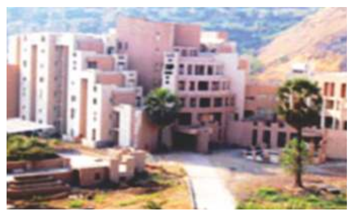
Total Area - 56000 Sq.ft. Total number of Rooms - 149 Total Capacity - 333