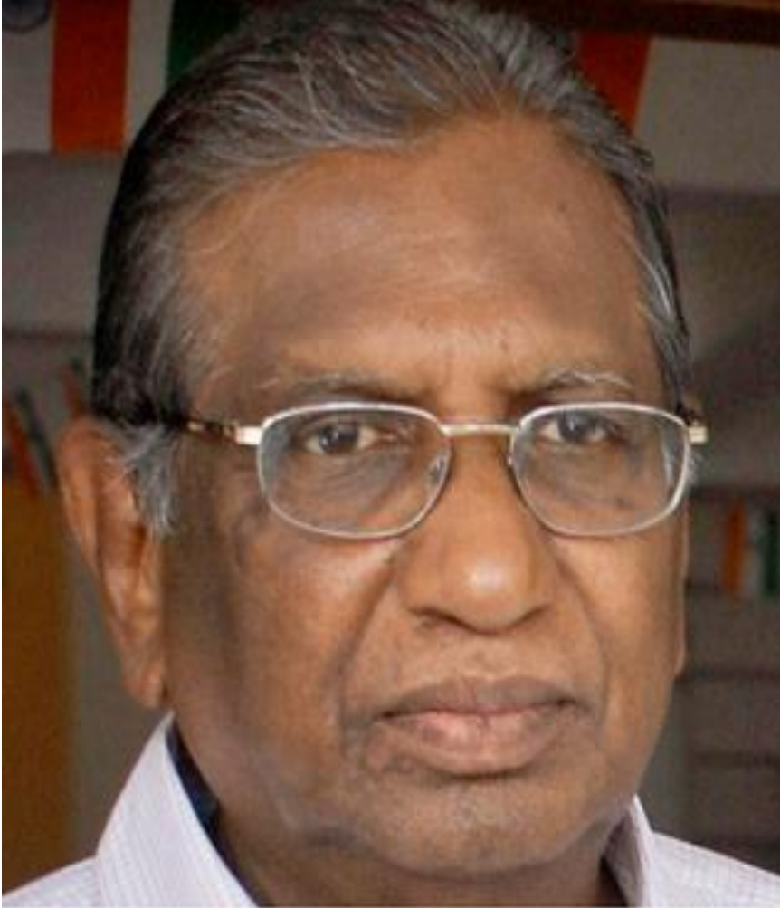
Prof. Kothapally JAYASHANKAR, The ideologue of Telangana, Indian Academic & Social Activist (1934-2011)